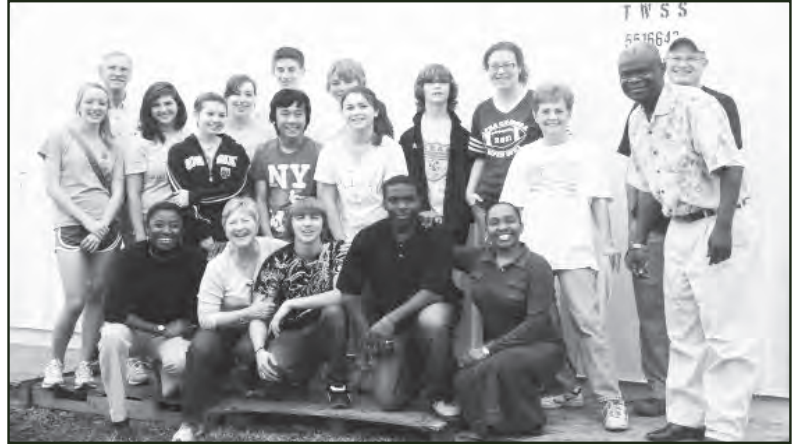
The Haiti relief group after a morning's hard work

One project in the planning stages has become desperate. The JELA School ("youth in action" in Creole) in Limbe, Haiti has been absorbing internal refugees from Port au Prince since the earthquake. The number of orphans they are caring for has doubled, and they are now feeding and