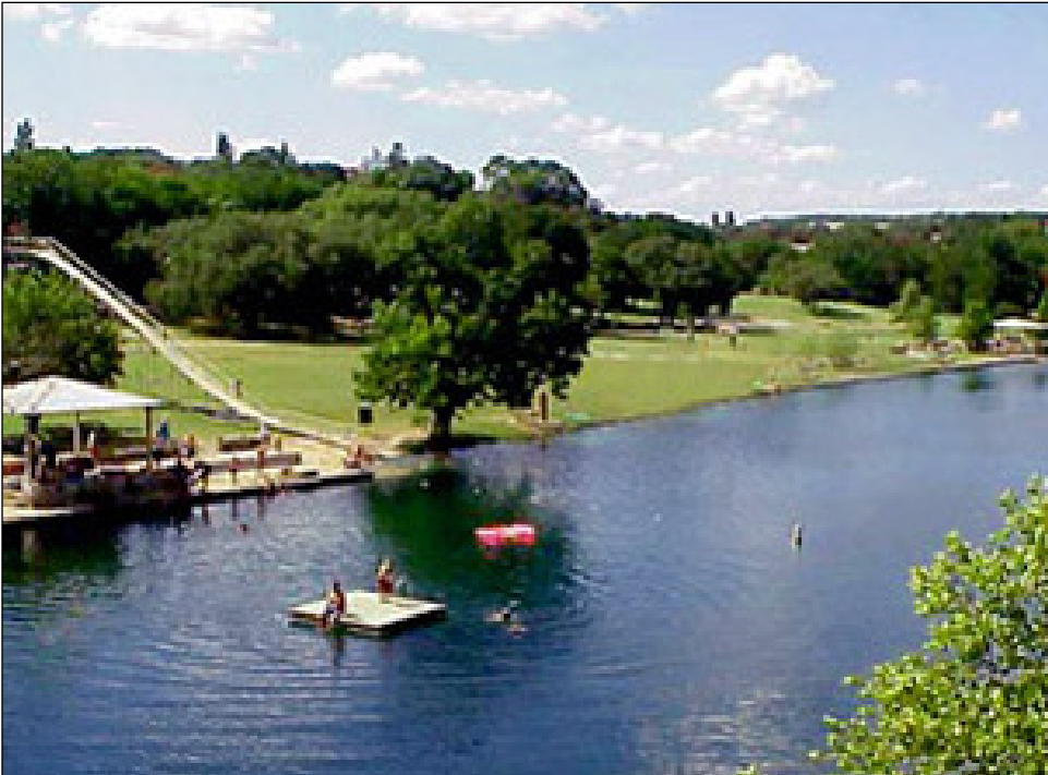
The river slide at Mo Ranch.