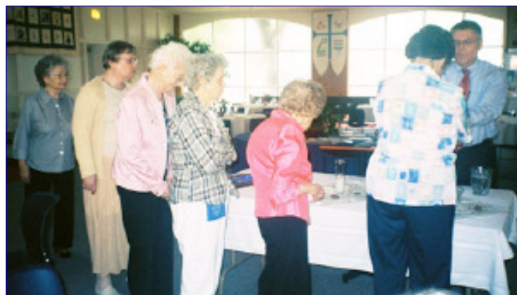
Presbyterian women renewing their baptismal covenant.

With our hands dripping in baptismal water, we promised to hold fast to God's promises in Jesus Christ.